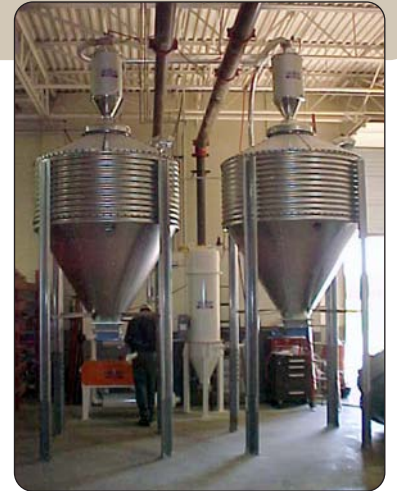
Corrugated Steel-Bolted Surge Hoppers