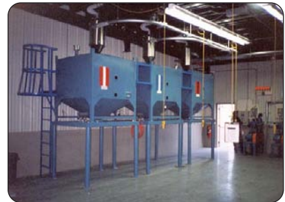
Elevated Discharge Bins