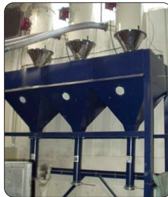
Powder Surge Bins